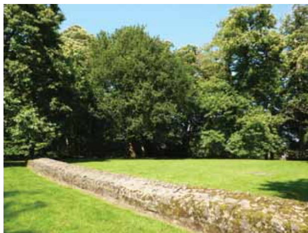
St Ann's Hill, with remains of the fortified manor.