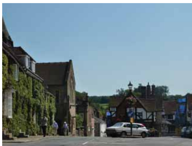
Even in the very centre of town, surrounding country is often visible on the skyline.