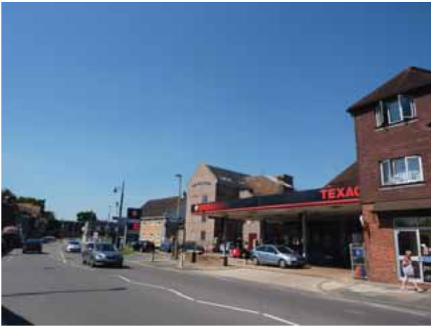
The air raid in 1942 created a vacuum which was filled by some of Midhurst's weakest buildings.