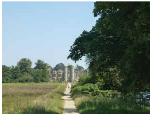
The Causeway toward Cowdray Ruins.

there is a blocked gateway and there may be potential to reopen this to provide an attractive path to St Ann's Hill. The cemetery is owned by Chichester District Council and could be enhanced through a regular maintenance regime.