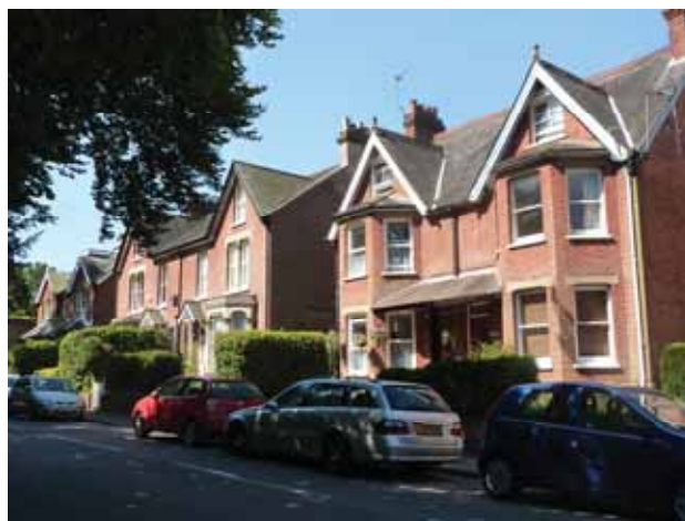
Unlisted Victorian houses can be vulnerable to incremental change unless protected by an Article 4 Direction.