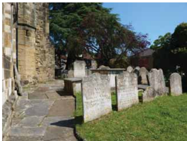
Churchyard of St Mary & St Denys.