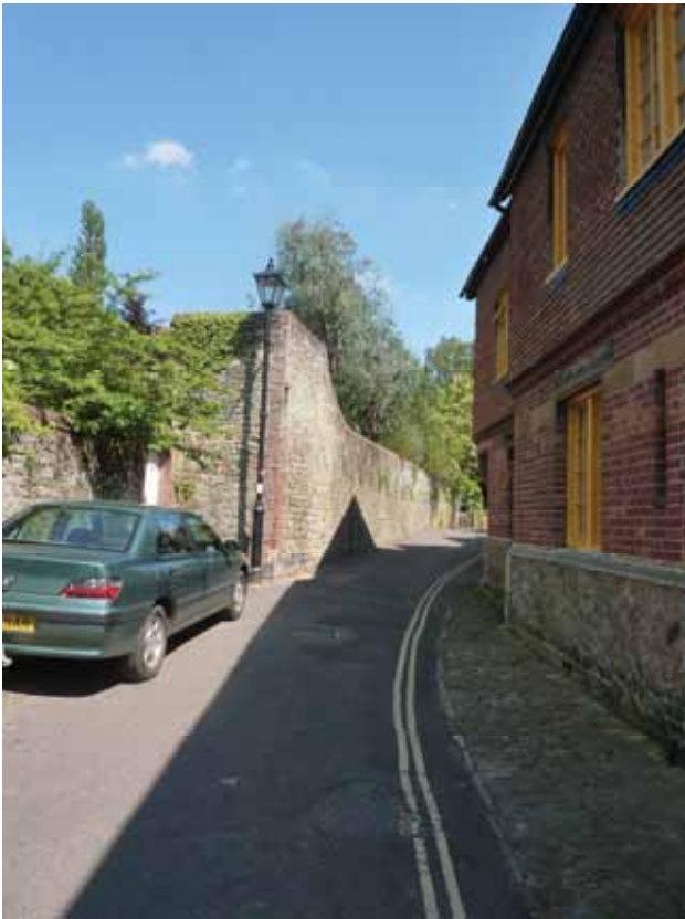
Boundary walls, such as this one at St Ann's Hill make an important townscape contribution to the Conservation Area