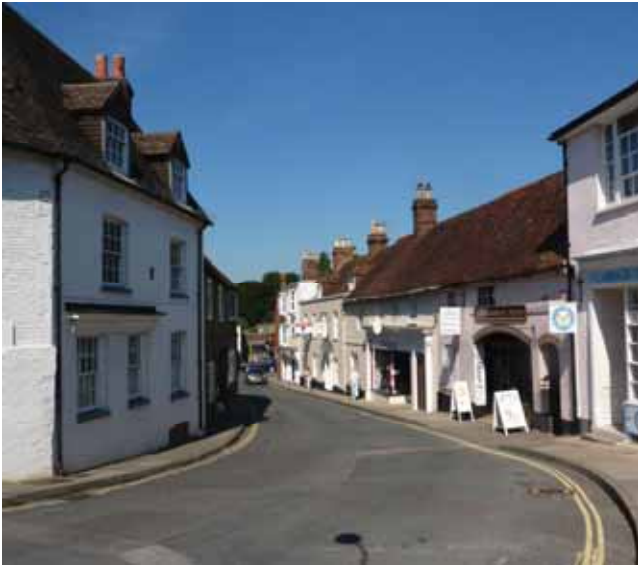
Knockhundred Row – commercial lane