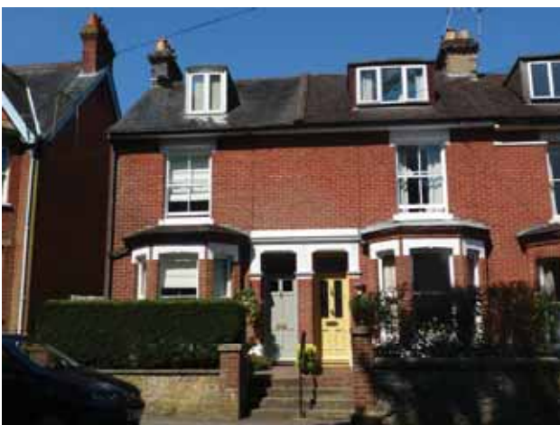
Good Victorian houses in Character Area 7.