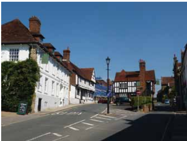
South Street – residential street