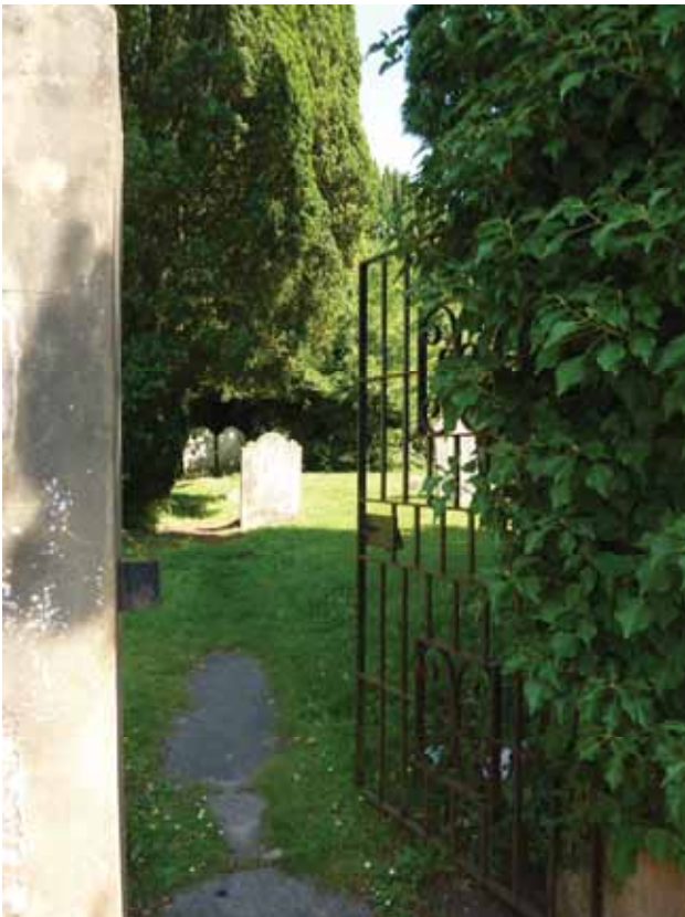
There can be a subtle interplay of urbanity and open space, even in the heart of the town