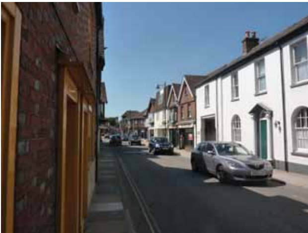
Rumbold's Hill is lined with good buildings but the environment is dominated by traffic.