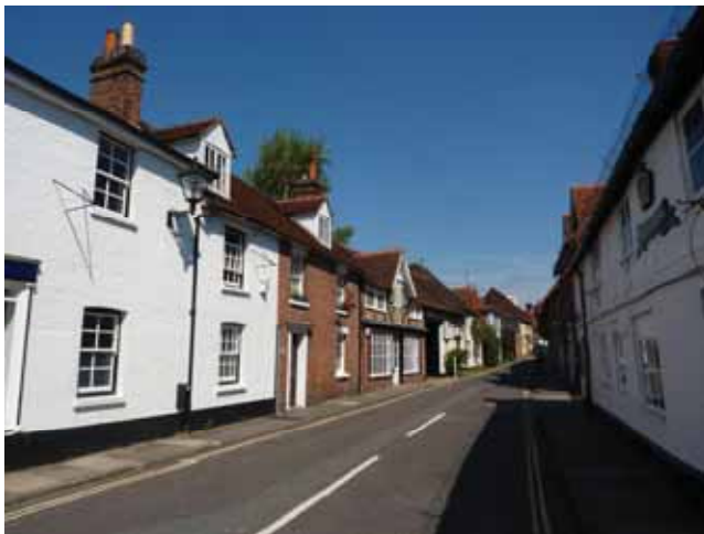
Sheep Lane – residential lane