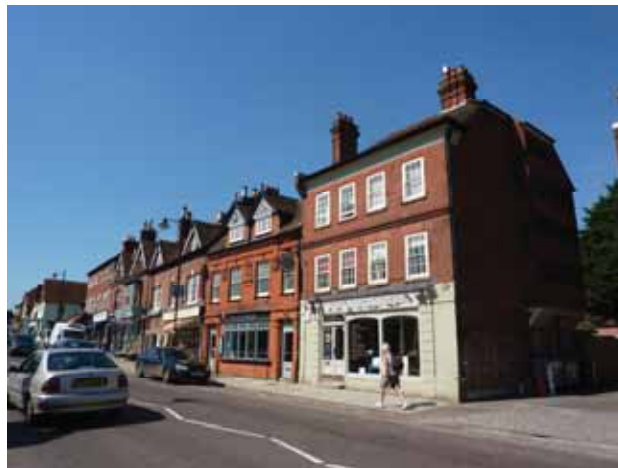
Shopfront design and signage is a critical component in the character of North Street.

Midhurst is particularly notable for its consistency of roof forms and for the use of hand made clay tiles. Several buildings have modern roof lights or dormers that are over-dominant. The specific protection of these features, particularly on the unlisted buildings where the Council has less control, is important. An Article 4 Direction is one way of ensuring that minor changes to roofs and chimneys to unlisted buildings are brought under planning control.