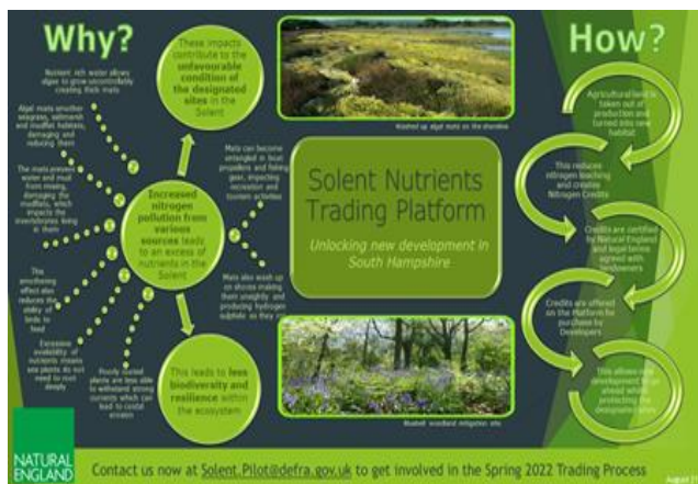
Impacts and Overview

These are attached in the email alongside this update and can also be obtained on request via the email address above. These infographics are designed to support our conversations with landowners who might be considering working with us to deliver nitrogen credits within the Platform.