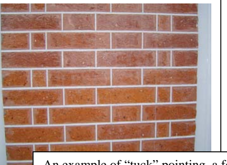
An example of "tuck" pointing, a form of pointing which utilises a line of putty mortar set into stained mortar. This was particularly prevalent during the 19<sup>th</sup> Century and could be used to disguise poor quality, chipped or irregularly shaped bricks.

Chimney stacks are an important historical feature and are invaluable when working out the history and development of a building. In many properties chimney stacks play an important part in the visual appearance of the building, for example on 18<sup>th</sup>