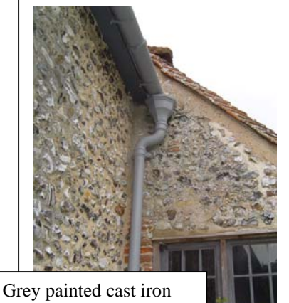
Grey painted cast iron rainwater goods to match plastic guttering!

Historically rainwater goods have been made from lead or cast iron and painted black. They can be invaluable when dating or finding out the history of a building as rainwater heads and other details were often decorated to contain dates or other identifying features such as owners initials.